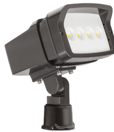
Slipfitter attachment DSXF1/2 TS H= 2-1/2" (6.3 cm) ID= 2-3/8" (6.0 cm) OD= 3-1/2" (8.8 cm)