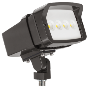
THK- Knuckle with 1/2" NPS threaded pipe