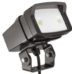
YK- Yoke mount