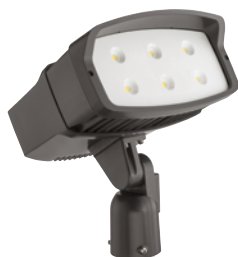
IS- Slipfitter Mount