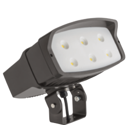
YK- Yoke Mount